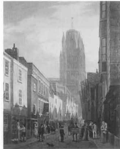
Redcliffe Street, 1825: the curved street at the bottom of Millerd's map

Bristol became a large port. Merchants in the city traded with West Africa and the West Indies and became very wealthy. Goods were taken to Africa, slaves transported from there across the Atlantic Ocean to the West Indies and tobacco, cocoa and other goods imported into the city. The town grew in size, and had many factories. As more people came to live and work there, new houses had to be built. Many old buildings were destroyed by bombs during the last war and by redevelopment since. But there are still about 60 timber-framed buildings built before 1700 in the central area, and many more from the following centuries a little further out from the centre.